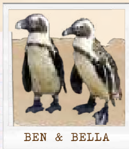
BEN & BELLA

Every purchase of Frosty's Lager helps to contribute towards adopting Mr. Frosty's friends, the African Penguins, at the Singapore Zoo!