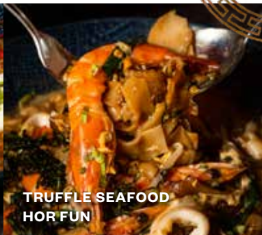
TRUFFLE SEAFOOD HOR FUN