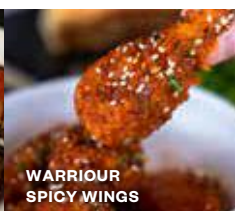
WARRIOUR SPICY WINGS