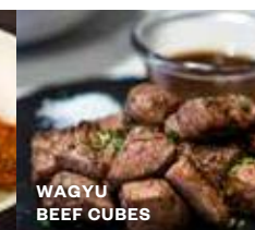
WAGYU BEEF CUBES