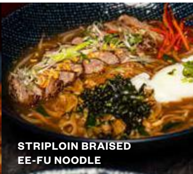
STRIPLOIN BRAISED EE-FU NOODLE