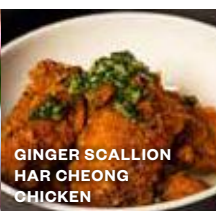
GINGER SCALLION HAR CHEONG CHICKEN