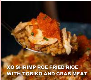
XO SHRIMP ROE FRIED RICE WITH TOBIKO AND CRAB MEAT

Japanese fried rice wok-tossed in XO sauce and dried shrimp roe, paired with fresh crab meat and orange tobiko