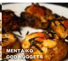
MENTAIKO COD NUGGETS