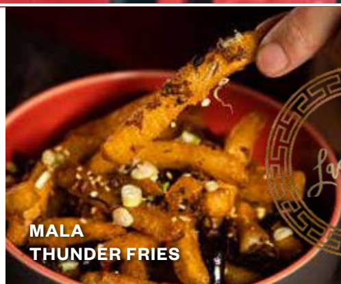
MALA THUNDER FRIES

Extra crispy shoestring fries infused with white truffle oil