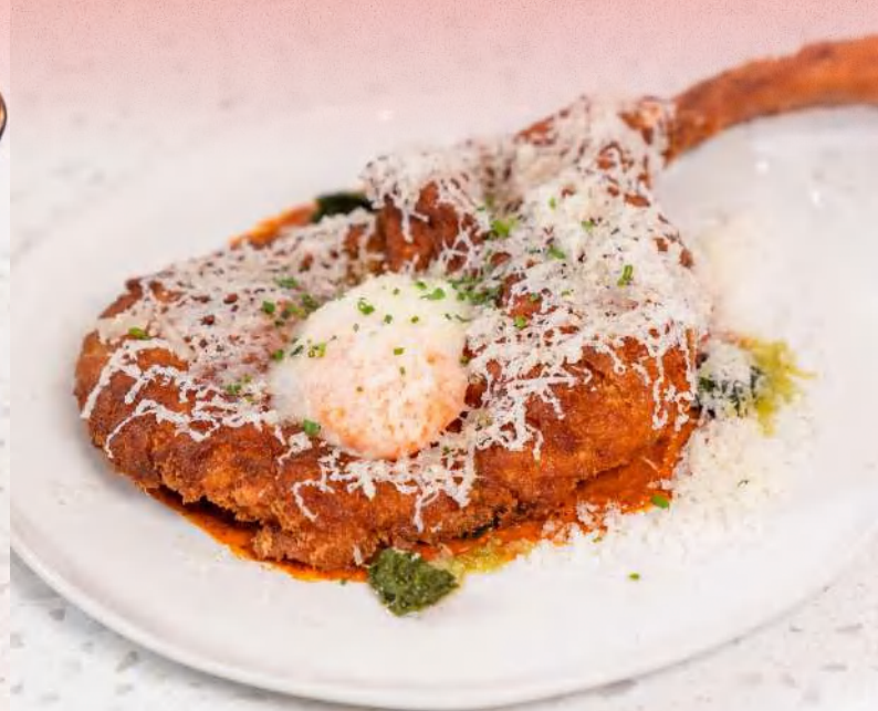
CHULETAS DE CERDO Breaded Pork Chops