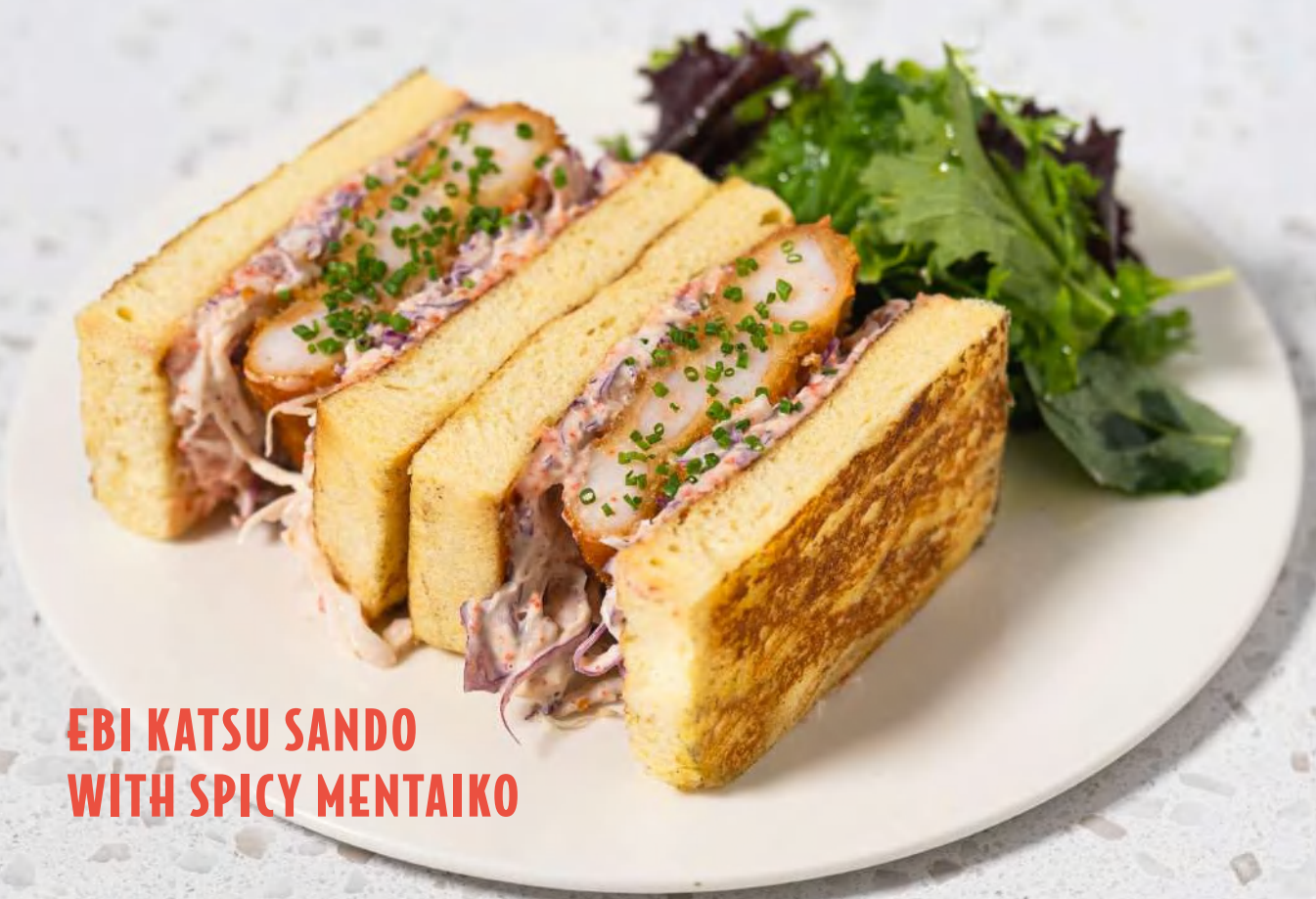
EBI KATSU SANDO WITH SPICY MENTAIKO