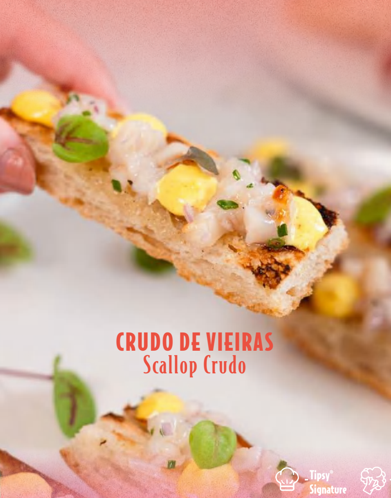
CRUDO DE VIEIRAS Scallop Crudo

VIEIRAS A LA PARRILLA 24 Grilled Scallops Japanese Scallops, Potato Purée, Heirloom Cauliflower, Sourdough Serrano Crumbles