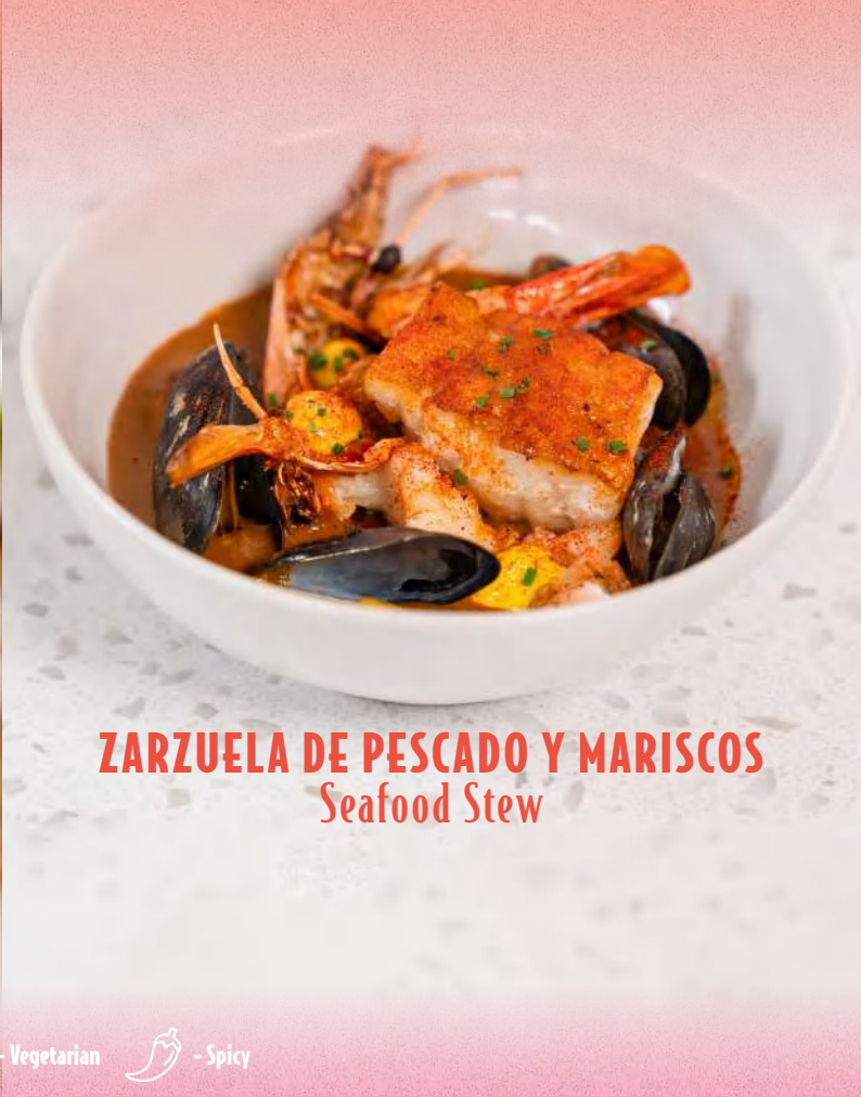
ZARZUELA DE PESCADO Y MARISCOS Seafood Stew