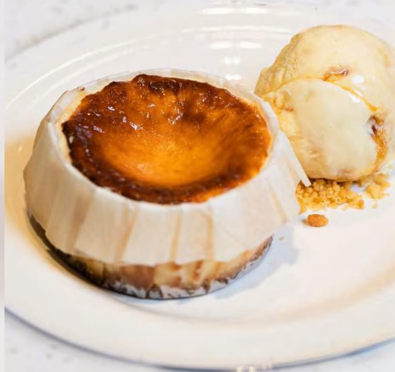
TIPSY® BURNT CHEESECAKE