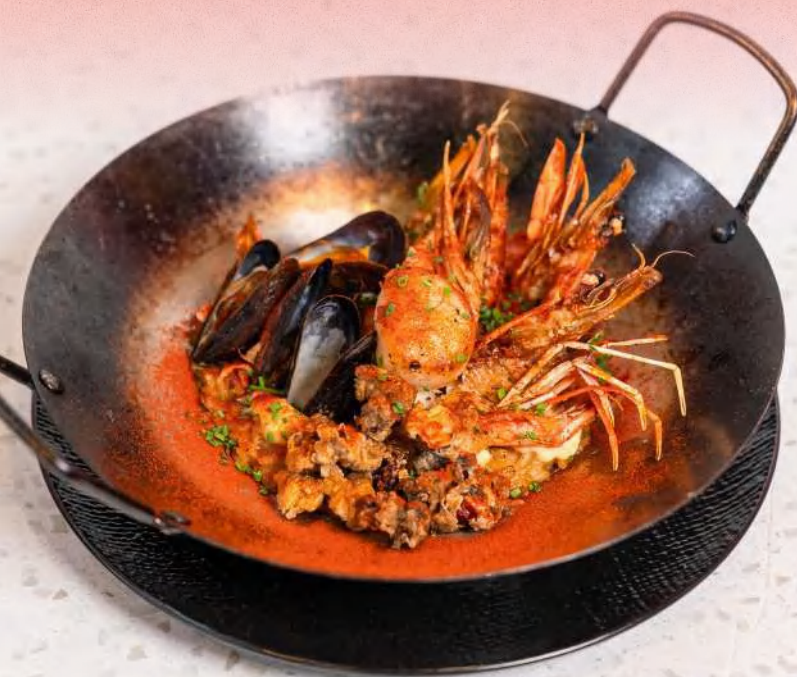
PAELLA DE MARISCOS Seafood Paella