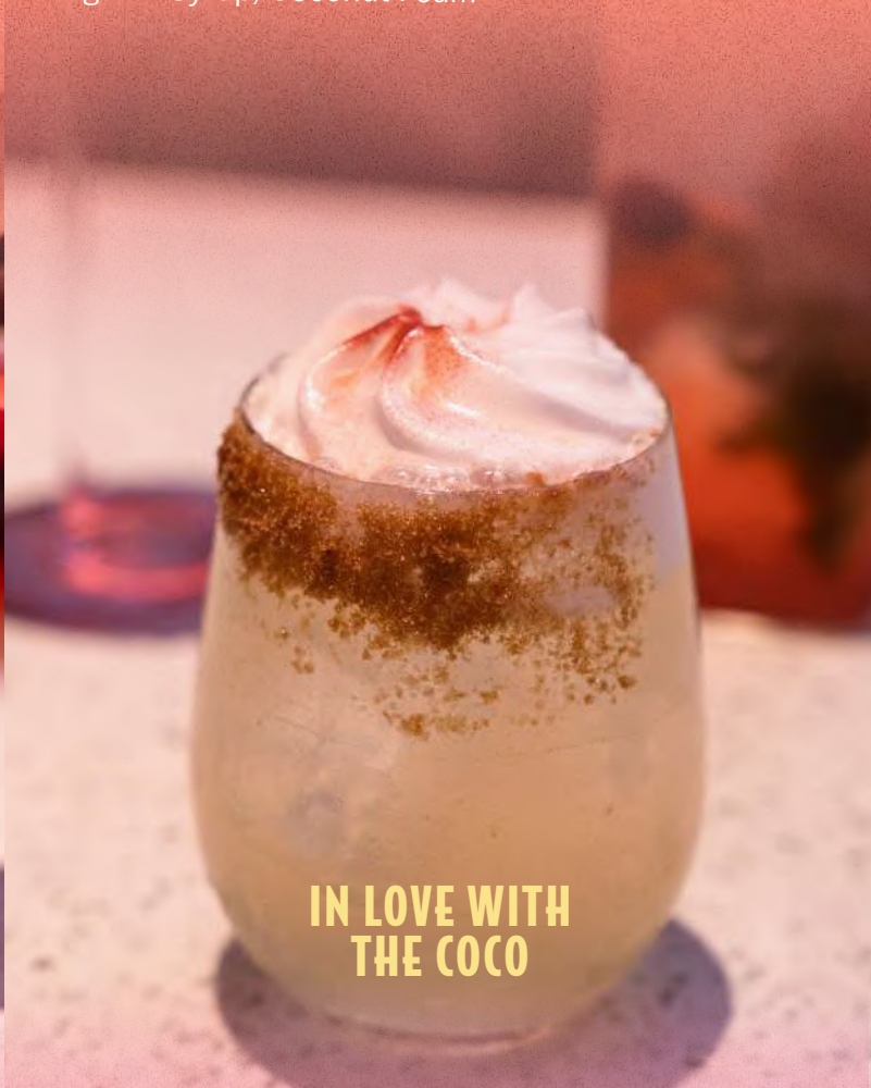
IN LOVE WITH THE COCO