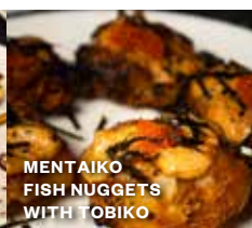
MENTAIKO FISH NUGGETS WITH TOBIKO