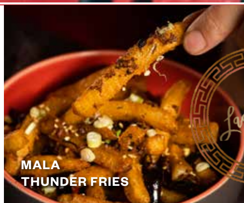
MALA THUNDER FRIES

Extra crispy shoestring fries infused with white truffle oil