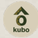
KUBO WOODFIRED KITCHEN

Instagram: Kubo.SG Facebook: Kubo Singapore