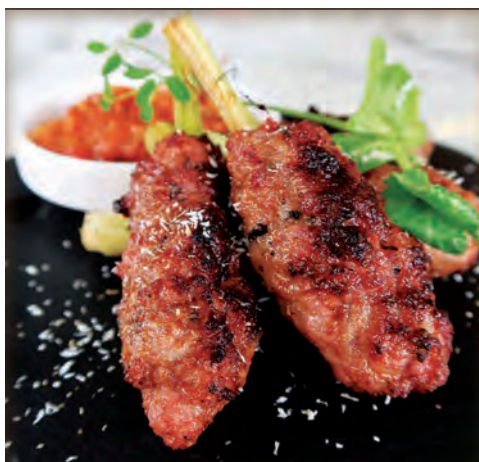
SATAY LILIT 18 with SAMBAL MATAH