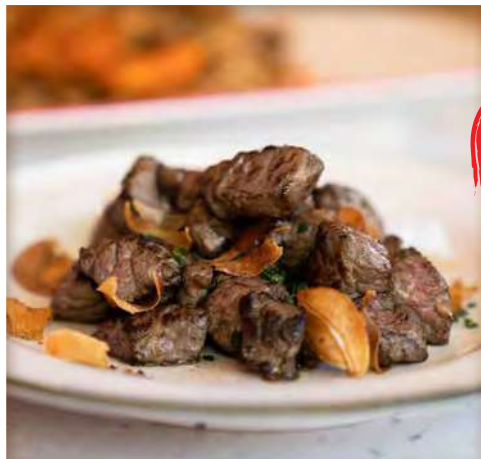
WAGYU BEEF 22 CUBES