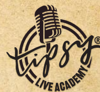
TIPSY LIVE ACADEMY