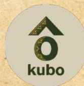
KUBO WOODFIRED KITCHEN